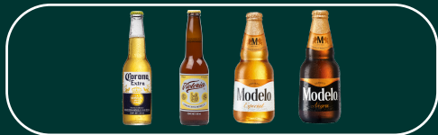
Modelo Especial or Negra Modelo